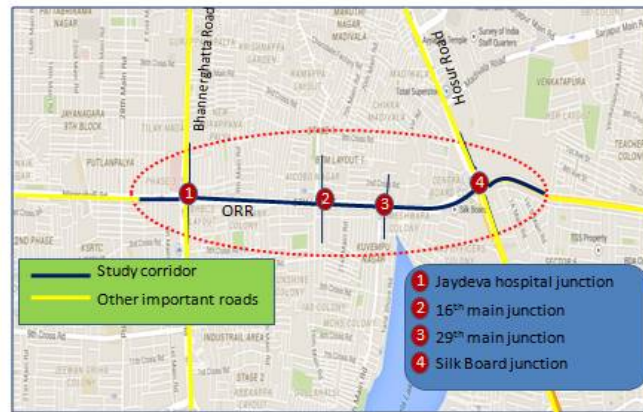
Fig. 2: Major Roads and Intersection along the Study Stretch